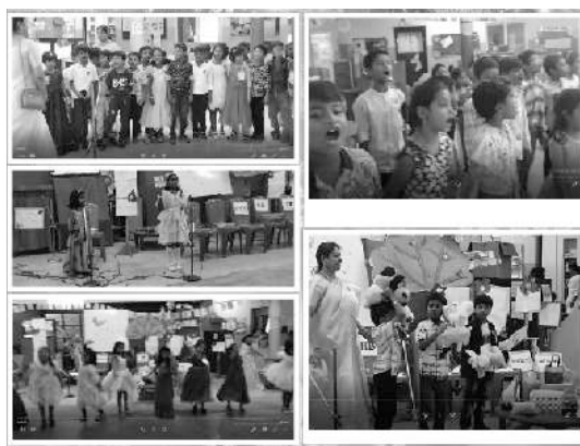
English Department , Junior section