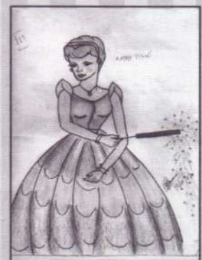
A Sparkling Smile