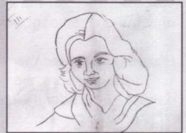
On Mother Earth