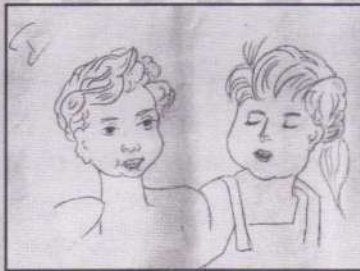
You and I .....