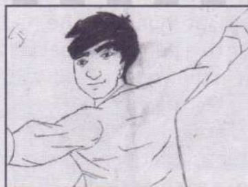
My name is .....