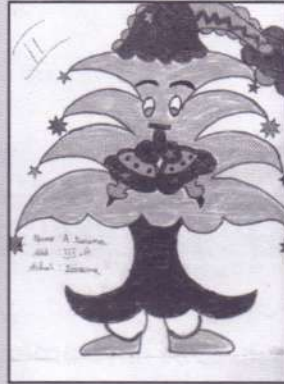
The Art of Living