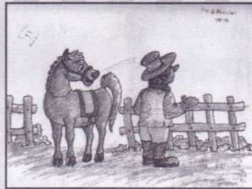
In this beautiful world