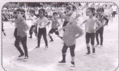
RHYTHM IS A DANCER