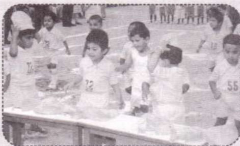
HATTERS TEA PARTY