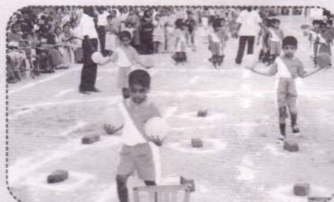
HAVING A BALL

The compere did an excellent job in creating the right tempo to make it lively.