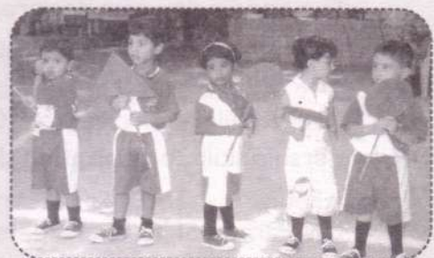
IMPROVISED FLY SWATTERS!