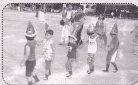
TOEING THE LINE